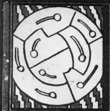
"THE GOLDEN DISK"