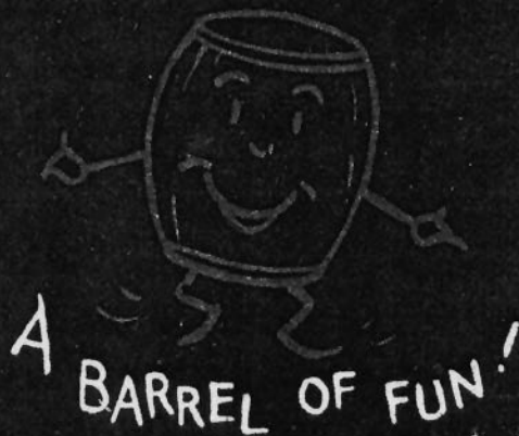
A BARREL OF FUN!