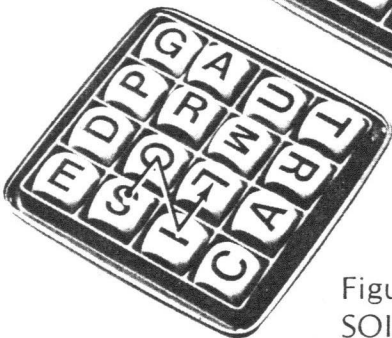
Figure 3 SOIL

Figure 4 shows an incorrect use of the same letters. "SOILS" cannot be formed here because there is only one adjoining "S", and it cannot be used twice in one word.