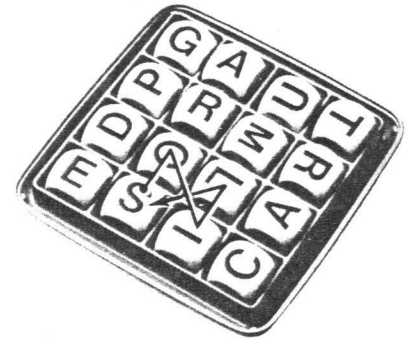
Figure 4 SOILS

Try your skill at finding the hidden words in the arrangement of letters used in the above examples. There are at least 70 words including "trails," "armor" and "prose" which are made up of properly joined letters. Maybe you can find more.