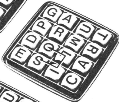
Figure 2 SILO