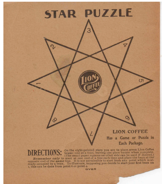
Game board (pieces on 8 Men in a Row side)